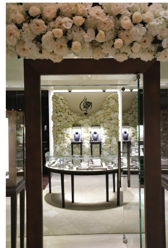
Moda Mall Wedding Week 2019