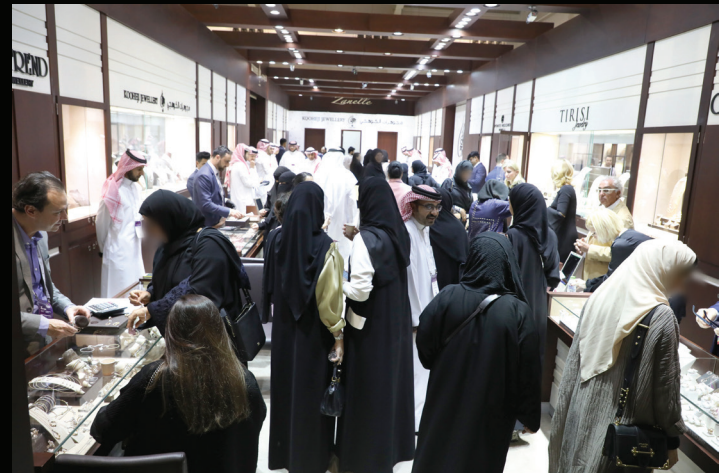
Jewellery Arabia Bahrain 2018