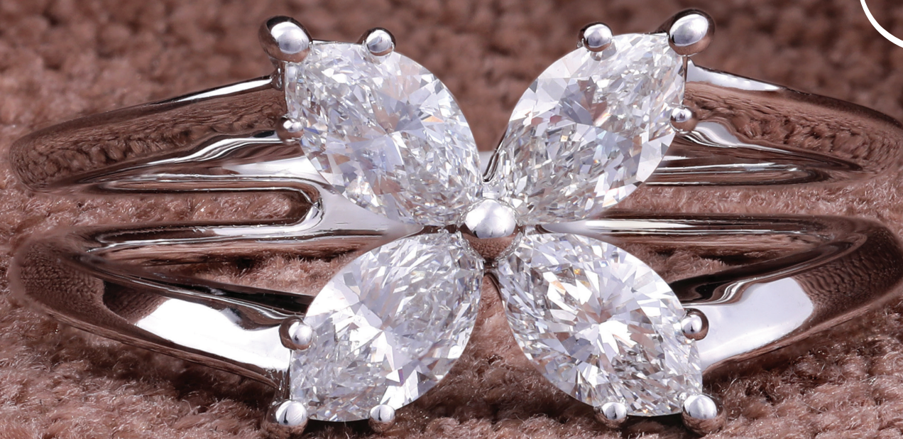
FAJER By KOOHEJI